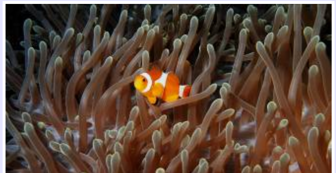
Breakwater as an artificial reef

The existing seabed within the confine of the marina comprises mainly of soft sediments. The proposed breakwater and the submarine structures serve the function of artificial reef. There is considerable knowledge in Hong Kong and elsewhere on the natural colonization of artificial reef with species such as seaweeds, crustaceans, bivalves, soft corals, amphipods, anemones, and mobile fauna including crabs and fish. Hence, the marina breakwater and other submarine structures will attract fish and other marine invertebrates into the area for food and shelter, resulting in enhanced fishery resources in the area in the long term.