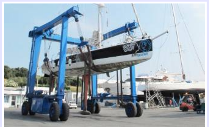
Various job opportunities: Yachts Repair and Maintenance