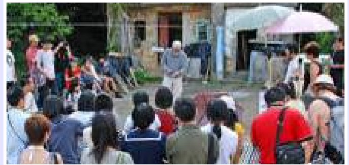
Green Job Opportunities

BoL is designed as an open community for enjoyment of the general public as well as the residents and workers there. They are free to enjoy themselves at waterfront plaza, use the road link between northern and southern part, hike on the footpath through the Conservation Corridor or on mountain trail to other parts of Lamma, swim at the public beach at Tung O Wan and admire the breathtaking view of Tung O Wan from the hill top public viewing gallery. They can take guided tour through the Conservation Corridor, attend interest classes, learn about Lamma’s natural history and human settlement, and learn how to appreciate culture and nature as well as to respect them.